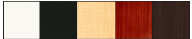
Standard Line Fixtures are available in 5 melamine finishes: White, Black, Light Maple, Cherry & Espresso

*black cases have option of white interiors